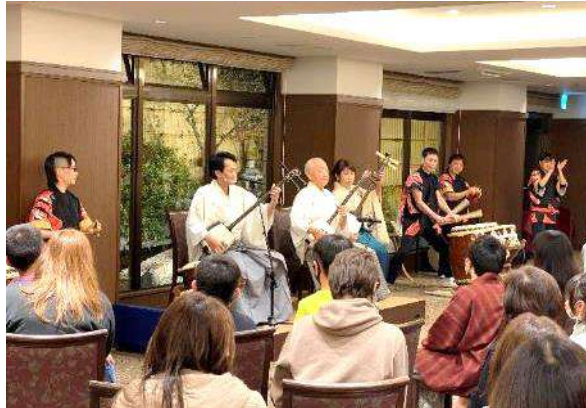
Suigun taiko and Tsugaru shamisen show