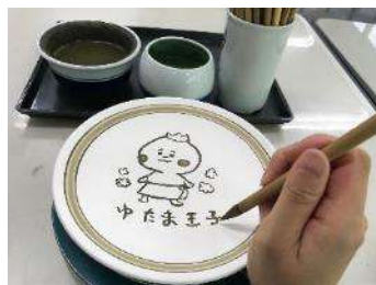
Tobe ware painting experience (prefectural cultural property)