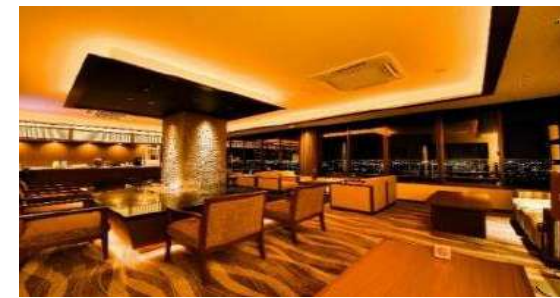
HOSHIZORA Club Lounge