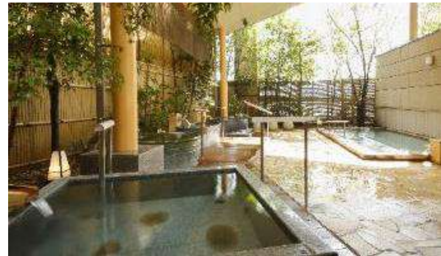
Left Hot Spring(HIDARINOYU) 5 types of hot springs