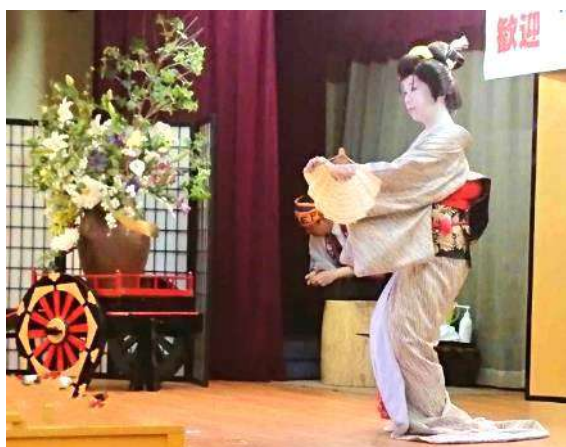
Japanese dance performed by a geisha

Various events at the hotel are also attractive.