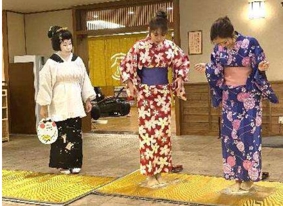
Udon Show by Geisha