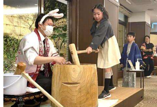
Hot Spring Mochi Pounding Show

Various events at the hotel are also attractive.