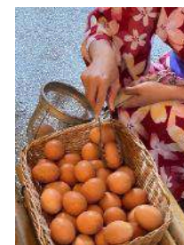
Experience making boiled eggs in hot springs