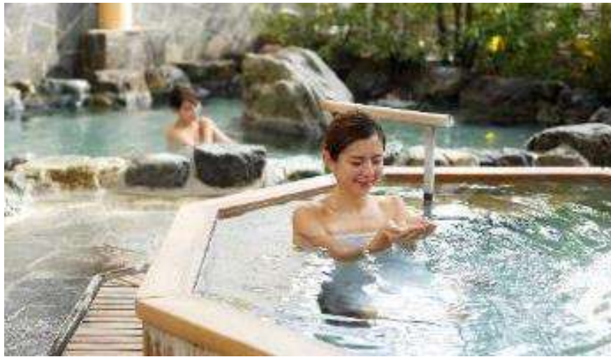
Right Hot Spring(MIGINOYU) 3 types of hot springs