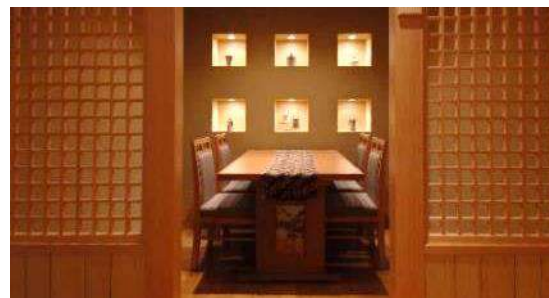
Private room Bizenan Uchiko